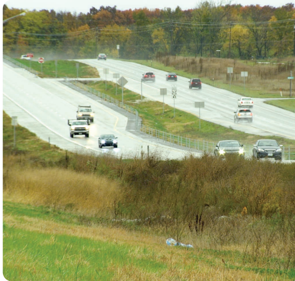
Boone County, MO RCUT Intersection

An RCUT also can support community goals for pedestrians and bicycles. Provisions for walking and biking must be considered throughout the project development process, with the needs of pedestrians and bicycles shaping the overall design of the RCUT accordingly. This includes pedestrian crossings that are accessible to all users, and when signalized, phases that accommodate both pedestrians and bicycles. The channelization used in the RCUT design can serve as effective refuge islands for pedestrian crossings and/or as bicycle queuing areas.