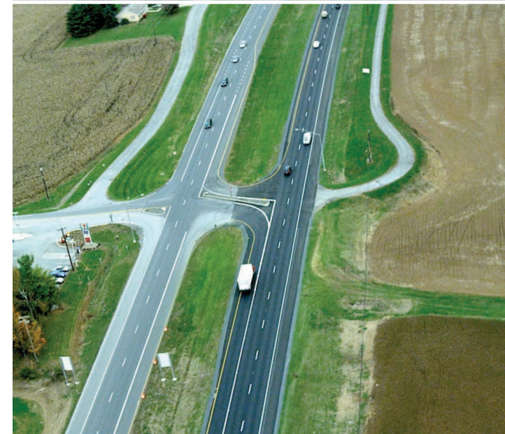
Frederick County, MD RCUT Intersection

AN INNOVATIVE, PROVEN SOLUTION FOR IMPROVING SAFETY AND MOBILITY AT SIGNALIZED AND UNSIGNALIZED INTERSECTIONS